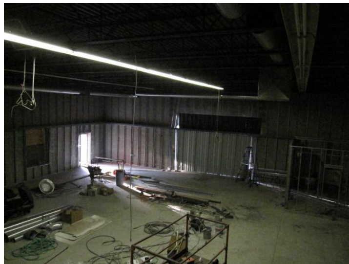
A view from the Balcony A. Liskow (c) 2009.

With the renovation design and blueprints in hand, the construction work began very soon after the Board decided to move forward with the project. In the three weeks since the "Bare Walls" Fundraising Party, significant progress has continued: Most of the electrical wiring was roughed in including a new electrical feed to the building. The HVAC unit was installed on the roof, as has much of the ductwork. The stairway to the second floor balcony and office/library area was constructed, and the big garage door has been removed to allow for the glass door installation.