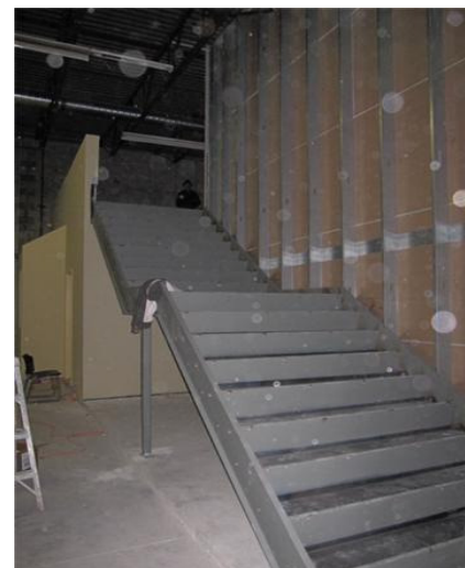
Stairs to the Balcony A. Liskow (c) 2009.

In addition to the renovation, a major task is to plan the logistics of managing the use of the space. This plan will include our current activities as well as many new AACTMAD activities and events that will use the dance space when it is ready. Our plan will accommodate growth of our organization and make the space available to third party users. In other words, we will implement our Business Plan.